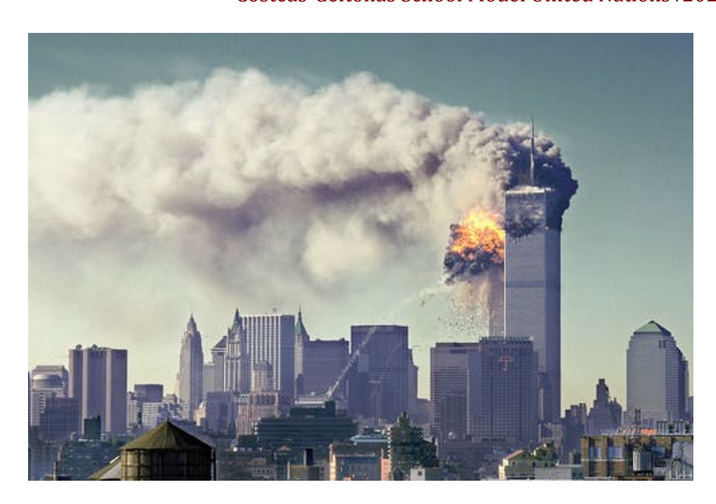
Picture 1: The picture depicts the moment when the two airplanes crashed into the twin towers of the World Trade Center in New York

The International Financial Crisis of 2008 started in the United States of America and it was the consequence of the destruction of the American housing market. Because of this phenomenon the international financial system was almost destroyed while companies related to insurance issues, banks (especially commercial ones), organizations related to loans and saving were closed down. The International Financial Crisis of 2008 has been characterized as the second biggest financial downturn since the Great depression during 1929-1939.